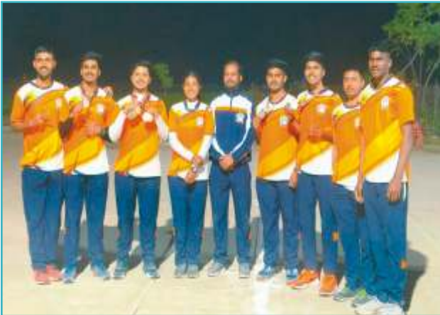
The university's girls' and boys' teams that participated in the All India Inter-University Archery Competition