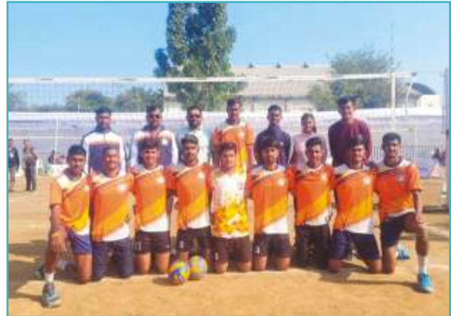
The team that won the silver medal in the volleyball competition at the Maharashtra State Inter-University Sports Festival