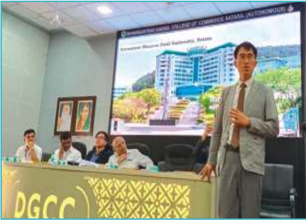
Guidance on 'Korean Language Study and Job Opportunities' by a delegate from Tongmyong University