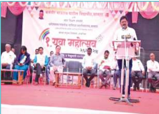
Hon'ble Shri. Deepak Deshmukh, actor, guiding the participants at the Youth Festival