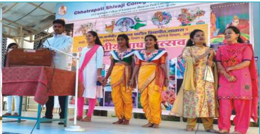
Programmes conducted by the Board of Languages