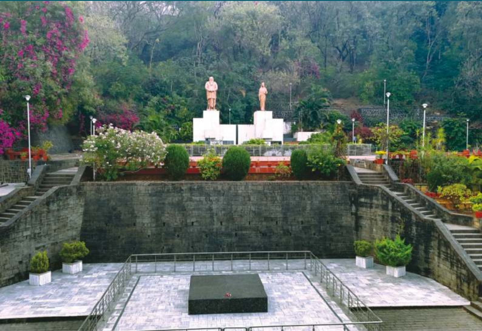
Karmaveer Samadhi Parisar