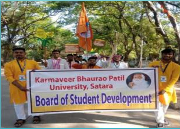
Participation of our students in the Inter-University Youth Festival