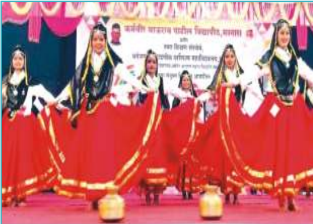
The girl students, while performing a folk dance at the First Youth Festival