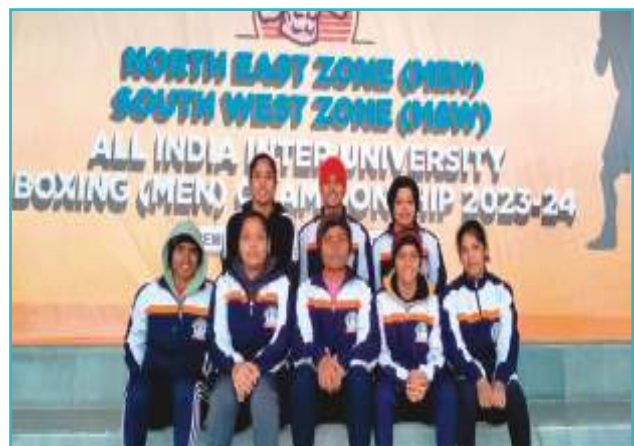
The girls' team that participated in the South West Zone Inter-University Women's Boxing Competition