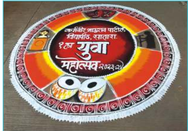
A beautiful rangoli design at the First Youth Festival