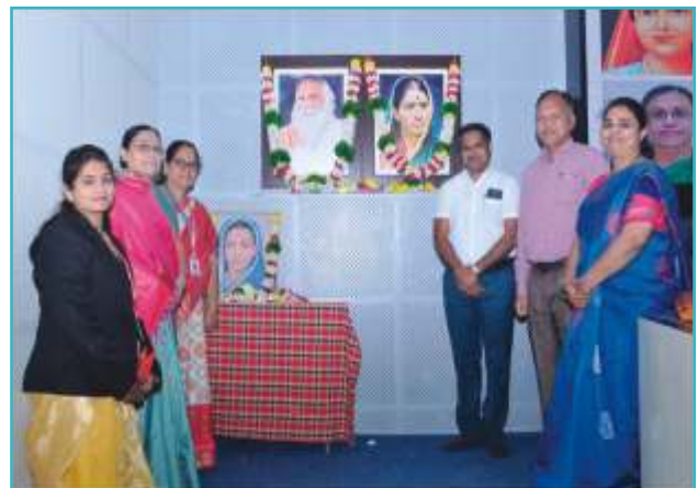
Offering humble tribute to Savitribai Phule on the occasion of her birth anniversary (Sou. Laxmibai Bhaurao Patil Chair in Women Empowerment)