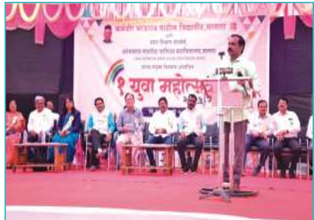
Hon'ble Shri. Santosh Patil, actor, guiding the participants at the Youth Festival