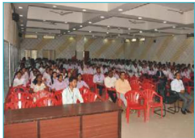
Participating students in the workshop on 'Career Opportunities in various Sectors'